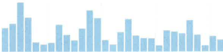
Tweets by Day Feb. 1-29

Tweets earned 34.4K impressions over this 29 day period. During this 29 day period, 1.2K average impressions per day.